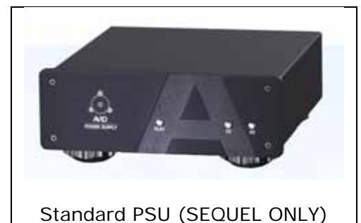
Standard PSU (SEQUEL ONLY)