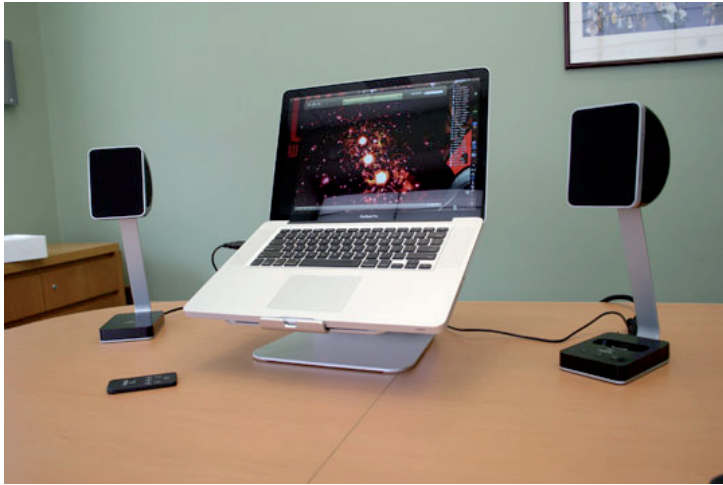
Above: OK, I don't have a fancy glass chair, but the speakers still look nice even when connected to a MacBook Pro.