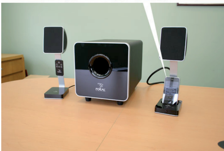
Above: Works with iPhone? Yeah, it does, but someone tell that to the iPhone.